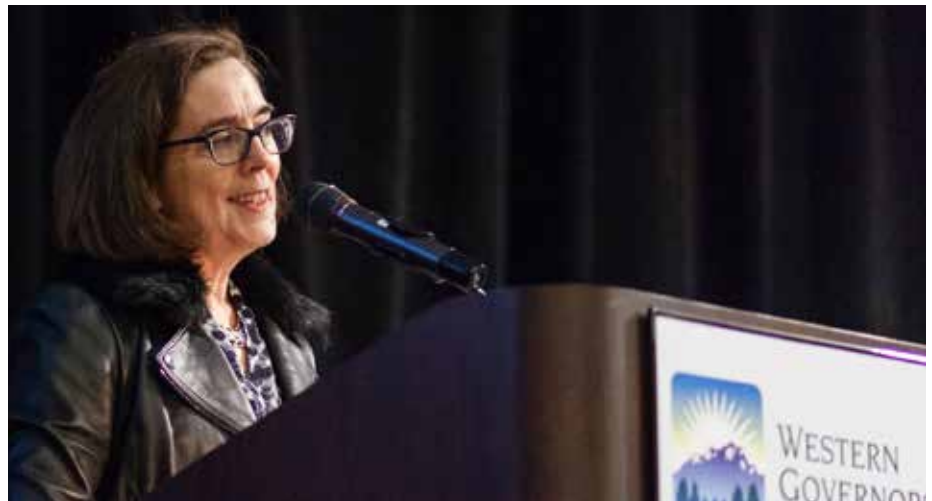
Governor Kate Brown noted during her opening remarks at the Bend workshop that "In Oregon, we continue to pursue strategies to accelerate the pace, scale, and quality of restoration of our federal forests."

Governor Brown noted, as an example, that in 2006, the timber sale program on the Malheur National Forest was effectively zero. Disagreements over forest management were grinding restoration activities to a halt. The formation of the Blue Mountain