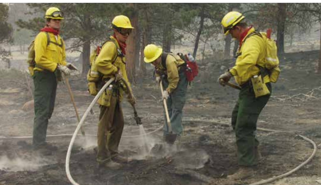
Firefighters on the 2002 Hayman Fire, whose long-term impacts dramatically affected water quality and supply for the Front Range of Colorado.

The state estimates that since 2010, more than 100 million trees have succumbed to the stress of beetle infestation or drought. Of California's 32 million acres of forestland, over 6 million acres have been classified as either Tier I or Tier II High Hazard Zones. The TMTF coordinates federal, state and local governments to ensure that restoration activities are organized effectively, ensuring that these high-hazard areas receive priority treatment. It also serves as an important focal point of communication between different layers of government, non-governmental organizations, tribes, and private landowners, providing regular updates on tree mortality and the status of restoration activities.