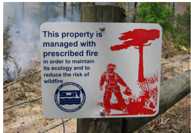
Prescribed burn on St. Johns River Water Management District property in Florida.

Additionally, it is important to understand that people have to perceive a risk in order to feel that something needs to be done about it, either on their property or in terms of support for agency fuels treatments. However, perceiving the risk is not in and of itself sufficient as people respond to risk differently. Many people choose to live in the interface for the benefits they perceive— aesthetics, privacy, views, etc. These individuals may be aware of the risk of fire but feel the benefits balance or outweigh the risk. Thus, they may need to understand how actions mitigating fire risk and creating defensible space are not inherently incompatible with, and may actually enhance, the amenities they value in the interface.