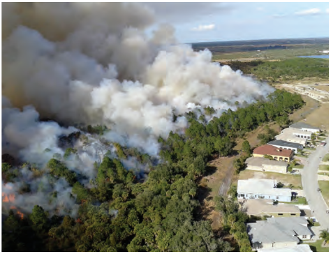
Prescribed burn on St. Johns River Water Management District property in Florida.