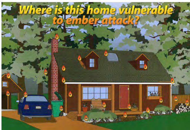
Living With Fire program materials focus on specific actions homeowners can take to reduce their fire risk.