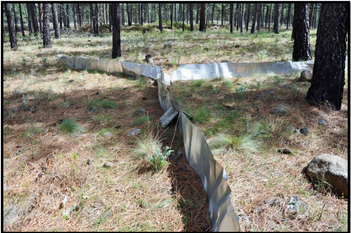
Pitfall trap used to capture small mammals, reptiles, and terrestrial amphibians.