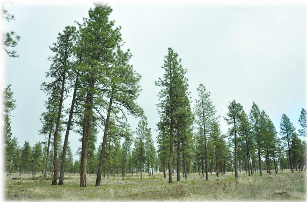
Post thinning and Rx burn view of clump prescription.