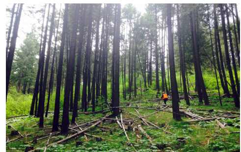
Burned area in the Okanogan-Wenatchee NF.

In this paper, researchers examine the problem of growing wildfire risk through a coupled natural and human systems (CNHS) perspective. They characterized the primary social and ecological dimensions of what they termed a socioecological pathology of wildfire risk in temperate forests, or “a set of complex and problematic interactions among social and ecological systems across multiple spatial and temporal scales.” By paying particular attention to the wildfire risk governance system, which is influenced by both ecological conditions and diverse parties with competing goals, policies, and practices, the authors investigate strategies for reducing wildfire risk.