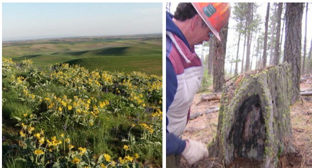
Left: Plant communities were historically dominated by dense bunchgrasses mixed with forbs and shrubs as seen in a remnant prairie in Kamiak Butte County Park, Whitman County, Washington. Right: One of the old fire-scarred ponderosa pine stumps sampled to reconstruct fire history.