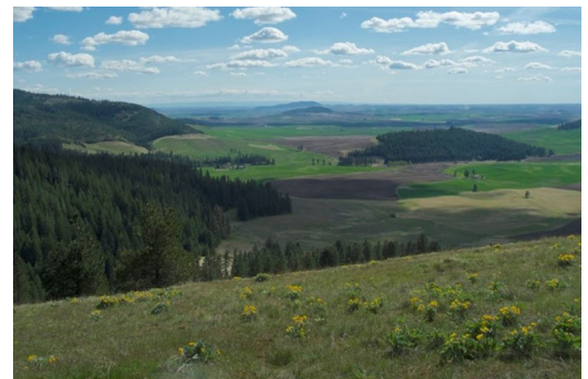
The rolling hills of the Palouse Prairie are today dominated by intensive agriculture with fields of wheat and legumes separated by roads and bordered by dense mixed-conifer forests.

Historical fires in the Palouse ecotone occurred from lightning strikes and burning by Indigenous people. These historical fires were likely large, due to continuous rolling terrain and vegetation that was dry in summer and fall. Fires would have naturally extinguished as they encountered wetter fuels in deep forests and at higher elevations. Today, fire frequency in the region is dramatically reduced due to a mixture of new land uses and active and aggressive fire suppression. In addition, the modern landscape dominated by agricultural lands and roads limits the spread of lightning ignitions. The authors in this study used historical records, remote-sensing data, and reconstructed fire histories to better define the historical extent of the Palouse Prairie ecotone, estimate the historical fire return interval and identify and discuss implications for the future.