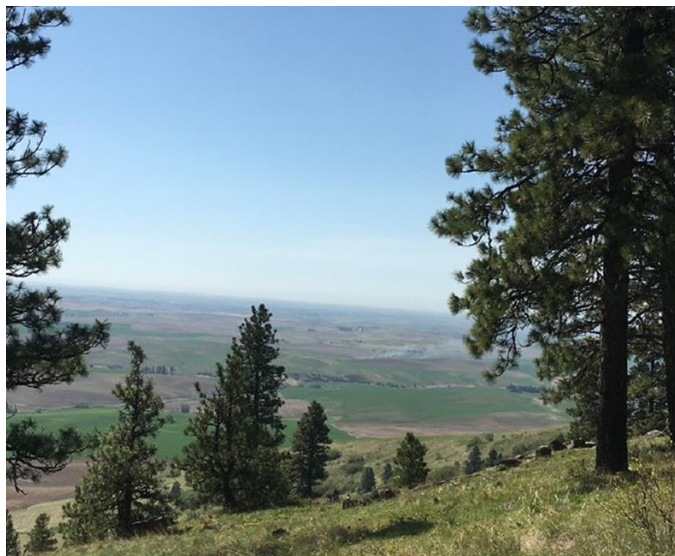
Scattered ponderosa pine trees in pine savanna adjacent to the Palouse Prairie today.

While the Palouse Prairie region is highly fragmented from its historical conditions, modern conservation efforts such as the Conservation Reserve Program and the Idaho Wildlife Habitat Incentive Program are converting some agricultural lands back to grasslands and forests. The historical composition of the prairie-forest ecotone described in this paper presents potential regional restoration targets for prairie and savanna cover. However, while restoring agricultural lands to prairie and savanna has many benefits for people and wildlife, it also increases fire risk. Human-caused wildfires are more common in developed areas and these conservation lands exist within a matrix of residential development. Roads also aid fire suppression in this landscape dominated by private ownership. Close partnerships and communications between property owners, land managers, and fire management organizations will provide opportunities for effective wildfire risk reduction and habitat restoration using prescribed burning and other vegetation management tools.