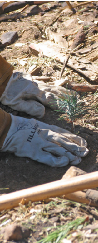
One-year-old seedling planted in a burned area with masticated material (mulch) around it.

preparation and tree planting, see Forest Stewardship Series 7 on forest regeneration (UC ANR Publication 8237).