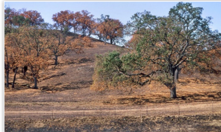
Figure 8. Burned oak woodland. Many of the trees with dead crowns survive by sprouting from their crown or base.