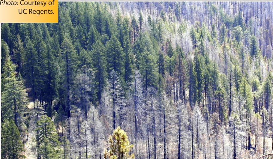
Figure 4. Small patch of high-severity burn. Note live trees that can act as seed sources in the background and regenerating trees in the foreground.