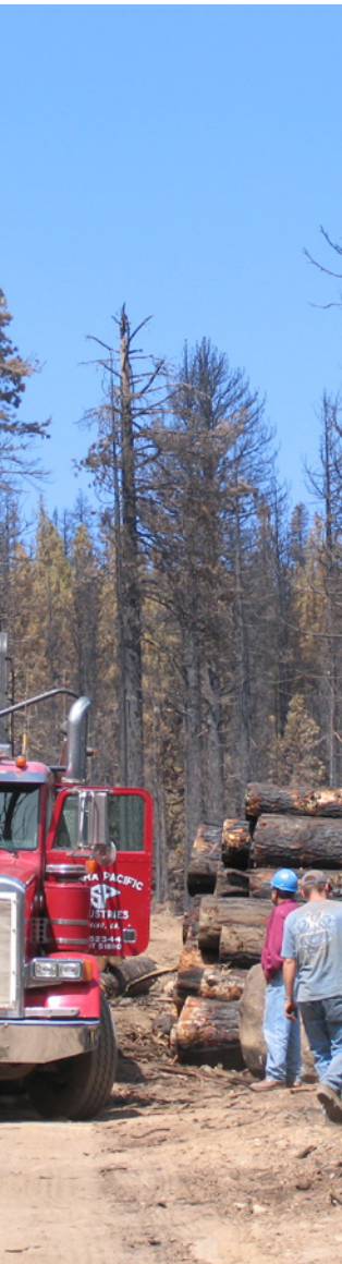
Salvage harvesting after the 2007 Angora fire.

for professionals. Whether to keep or remove a tree is a matter of opinion and depends on the values at risk in the path of potential tree fall.