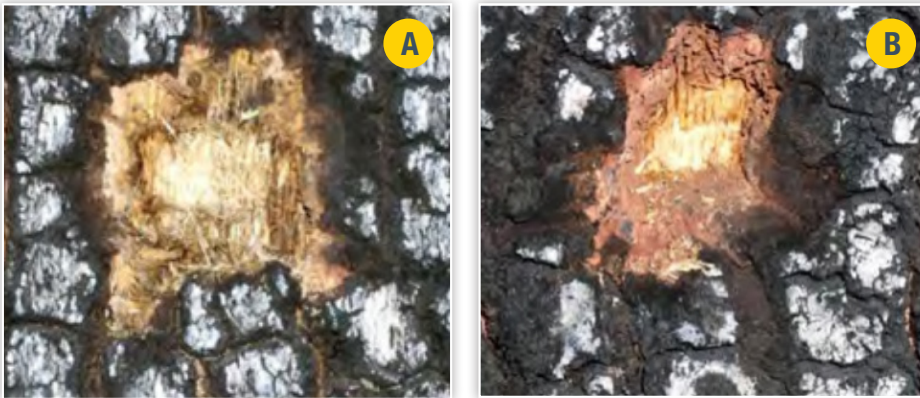
Figure 7. A) Dead cambium and B) live cambium.

The dominant conifer species in California include numerous shade-intolerant pines (such as ponderosa pine, sugar pine, Jeffrey pine, Coulter pine, and lodgepole) as well as numerous more shade-tolerant species (including incense cedar, white fir, Douglas-fir, and coast redwood). Most conifers, except coast redwood, do not sprout from underground roots. Therefore, an individual tree with totally consumed needles ( torched trees ) or severe damage to the cambium is dead, because it has lost its ability to photosynthesize and transport water and nutrients. Completely scorched trees (trees that were damaged by heat and whose needles were not burned but are dead and brown) generally do not survive, though in rarer cases these trees can flush new growth and survive. It is also common