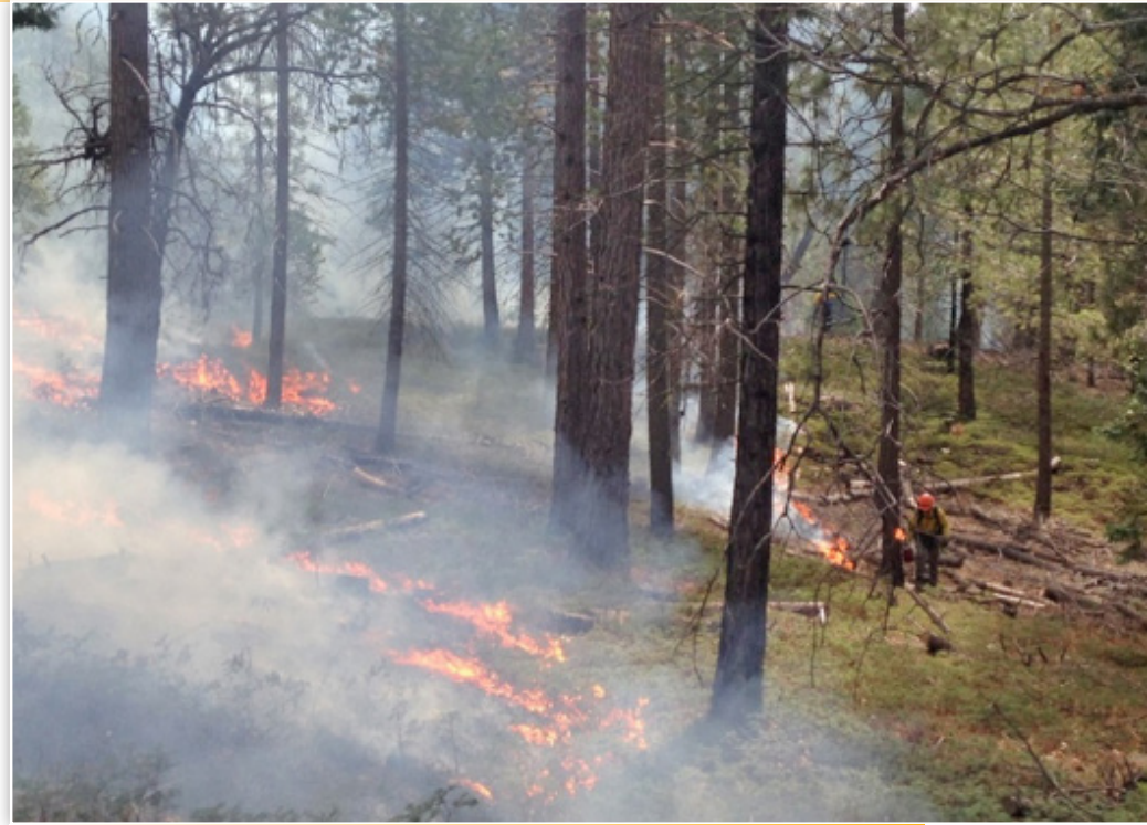
Figure 1. Low-severity prescribed fire, burning on the forest floor.

Ecological effects. Although there is considerable variation across the diverse forest types in California, mixed conifer is the most widely distributed type (and includes ponderosa pine, grey pine, sugar pine, white fir, Jeffrey pine, Douglas-fir, and black oak), and it is well adapted to frequent, low- to moderate-severity fire (table 1). Many of the dominant mature trees survive when fires burn with a mixture of low and moderate severity, which in turn can promote the growth of other plants. When some trees are killed, more light reaches the forest floor, and more soil nutrients and soil moisture are available to native species of grasses and flowering plants and to the remaining trees, which can increase their growth and vigor. Many of the species that occur in California's forests are well adapted to fire and can flourish after lower-severity fires.