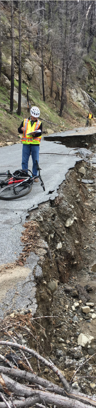
Road damage from postfire soil erosion that occurred in a severely burned area after heavy winter rains.

These erosion control treatments vary widely in terms of cost and application time. Average cost estimates for treating large landscapes, such as federally owned land, show that contour felling logs is the least expensive per acre and mulching is the most expensive. However, to date there are no comparisons for costs for smaller, private parcels. The cost differences per acre between treatments will vary by the amount of land to be treated, access routes, costs of certified, seed-free mulch, and availability of heavy-equipment contractors. We recommend that landowners first consider where and how much of their property may need treatment, review the overall pros and cons of different treatments, and then obtain cost estimates for their preferred treatment approaches.