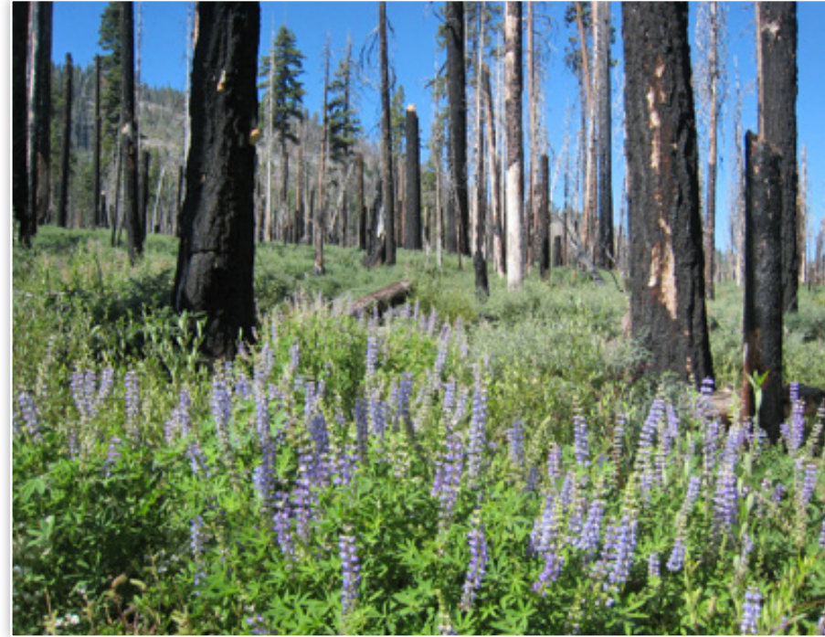
Figure 6. Postfire herbaceous plant response.

Many flowering plants and grasses have long-lived seed banks in the soil or mechanisms that enable them to sprout from their roots after fire. In some places, the postfire response of these plants can be quite vigorous, as the death of the larger trees has freed up resources for them to capture. Some plant seeds depend on fire to germinate, and some species can only grow in the conditions that occur during the first few years following a fire. In areas where the soil experienced very high burn severity, the fire may have killed