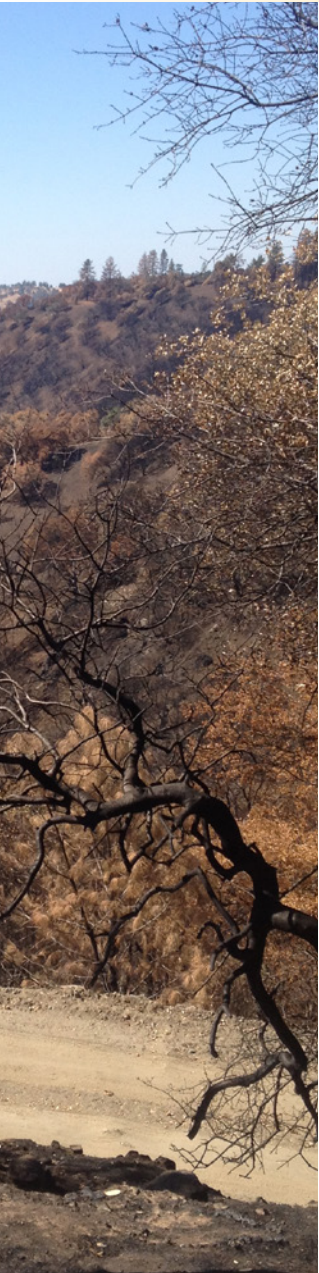
A forest road where the 2014 Sand fire burned directly above and below. The road system should be assessed after a fire to identify any increase in soil erosion potential.