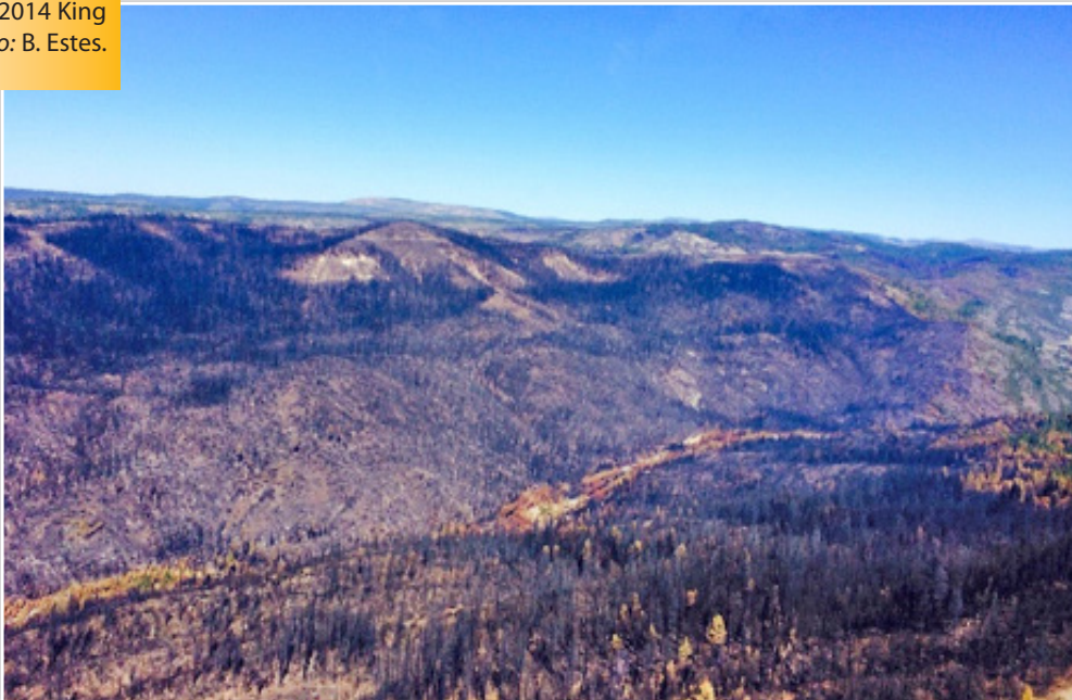
Figure 5. Large patch of high-severity burn from the 2014 King fire.

Landowner concerns. High-severity fire results in the greatest change to forests, and it raises the greatest number of concerns for the private landowner. Most broadly, it can include the loss of timber as well as the scenic and recreational value of forests. It can also create serious hazards, including dead trees, landslides, damage to infrastructure, soil erosion, and flooding. When the dead trees fall and add to the surface fuel, they can cause control problems for firefighters. When the downed trees accumulate among the tall shrubs that regenerate, they can burn severely in the next fire. Although smaller patches of high severity do not raise ecological concerns, they may require postfire action if they do not align with management goals or if they occur near infrastructure. It is helpful to map the variety of effects on your land, with specific emphasis on areas that have a contiguous mortality of mature trees, in order to evaluate postfire management options. In the next section, we outline ways to assess the state of your land and the common mitigation measures available to address these issues.