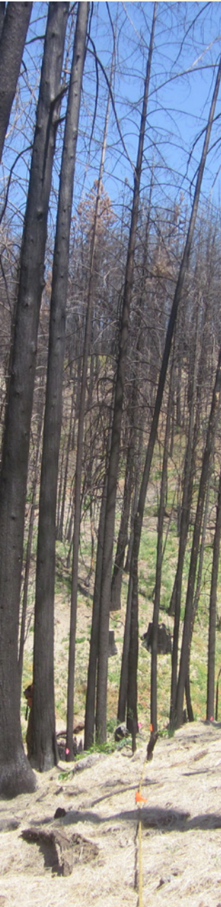
Straw mulch spread across a slope burned by the 2013 Rim fire in Stanislaus National Forest. The mulch is used to protect the soil from erosion caused by rain.

The final major determinant of erosion potential is the general pattern of rainfall in your region. The greatest erosion is produced in intense, short-duration rainstorms; it only takes one large rainfall event following a severe fire to create erosion problems. The largest erosion and runoff events occur when a major, high-intensity rainfall event occurs after a large, severe fire.