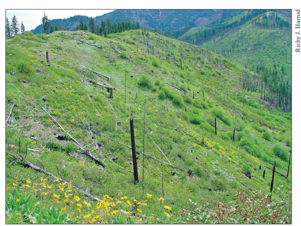
Fuels and vegetation recovery 10 years after high-severity wildfire and postfire logging following the 1994 Rat-Hatchery Fire near Leavenworth, Washington, in the Okanogan-Wenatchee National Forest.