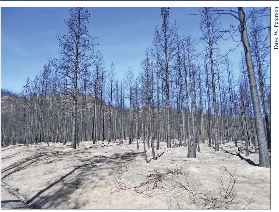
Standing dead trees in a high-severity patch burned in the 2015 Chelan Complex Fire on the Okanogan-Wenatchee National Forest. New research finds that postfire logging reduces future fuel loads, and when best management practices are used, minimally affects the regrowth of understory vegetation in dry forests east of the Cascade Range.

"An ounce of prevention is worth a pound of cure."