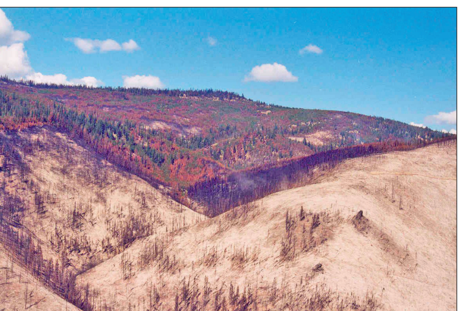
A reburn site in Poison Creek Watershed near Chelan, Washington. The lower half of the watershed burned severely in the 1970s, killing most trees and producing a large amount of downed woody fuels. The area reburned during the 2002 Deer Point Fire, and regenerating trees were almost completely consumed.

Unlike western Cascades forests, where centuries can pass between wildfires, wildfires historically occurred every 5 to 40 years in the dry, low-elevation forests of the eastern Cascades. "The fires in these forests were traditionally what we would call low- or mixed-severity fires that mostly burned fuels on the ground," Peterson says. "These fires are kind of like moving campfires, burning up a bunch of fuel—understory shrubs, dried needles, and wood sitting on the ground—but not killing many trees."