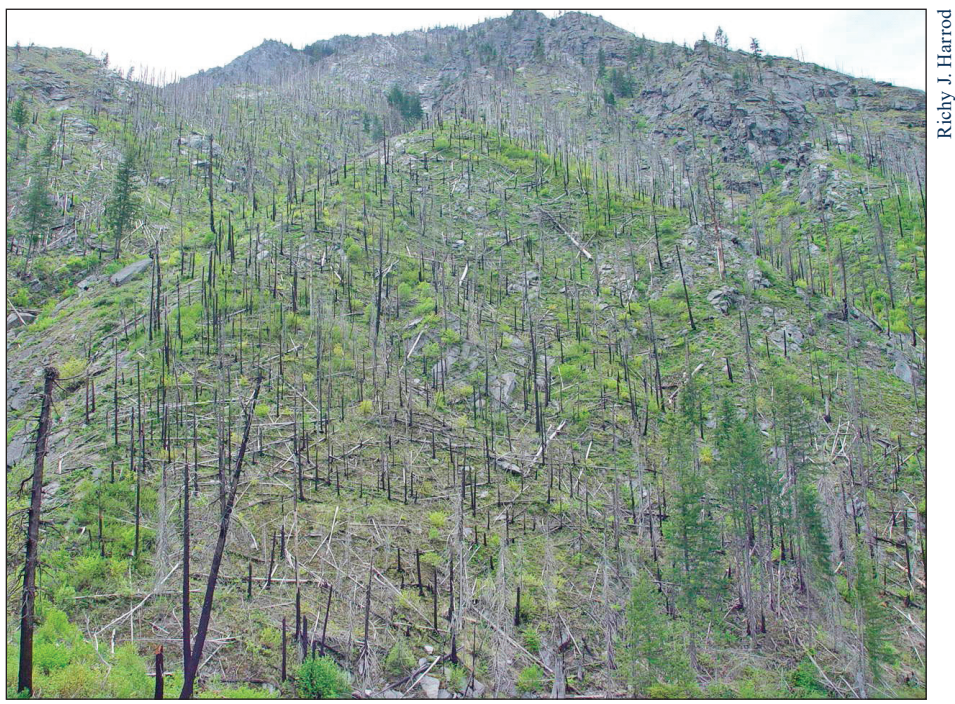
Accumulated fuels 10 years after high-severity wildfire on a site that was not logged following the 1994 Rat-Hatchery Fire.